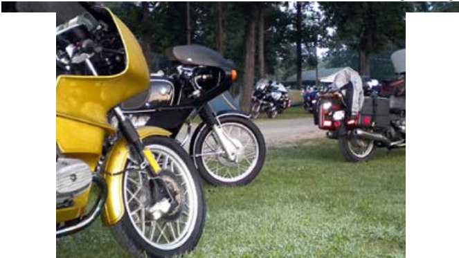
Old BMWs at the Four Winds Rally in Kittanning.