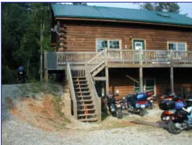
Whistle Stop Lodge

Our lodging of choice was the Whistle Stop Lodge. Set back 4 miles off of Route 28 South from Bryson City, NC, it is a rustic cabin with all the amenities. The cabin has a full kitchen, two refrigerators, a dishwasher, and a huge dining area. We relaxed in a cathedral ceiling great room with satellite TV, DVD, VCR, and Stereo. There were three full baths with instant hot water as well as a laundry room. There was plenty of room with five private bedrooms equipped with queen size beds as well as several futons. Ed commandeered the loft level for single sleepers, with four queen size beds in a common area. Outside were a hot tub, canoes, and a large gas grill. We had plenty of covered parking for the bikes under the wrap around deck. A fantastic view of the woodlands, a lake and an antique railroad spur all were a short hike down the hill. Yes, it was rough,