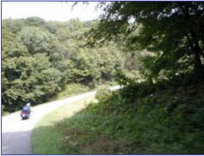
T&D pushing the LT through a sweeper on the Parkway