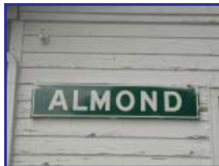
The Almond train station