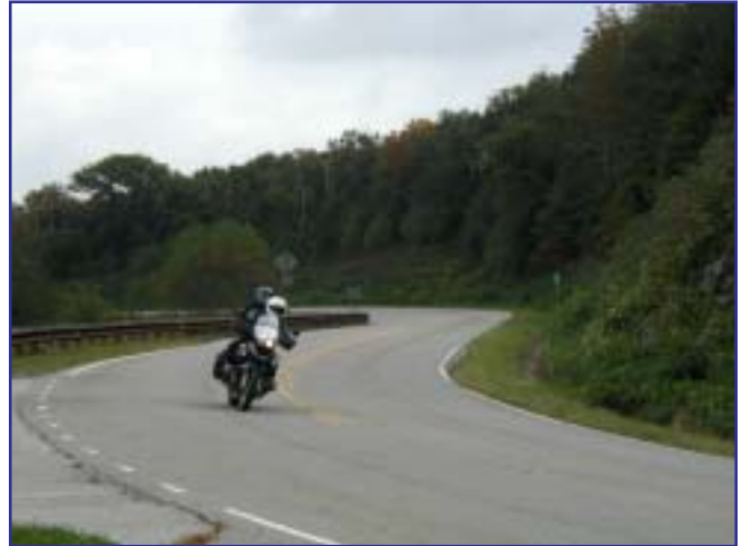
R&C, License Plate ANYRD (?Any Road?) on the Skyway

they could spend the whole day there while the remaining group