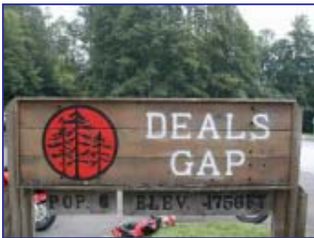
A very well photographed sign