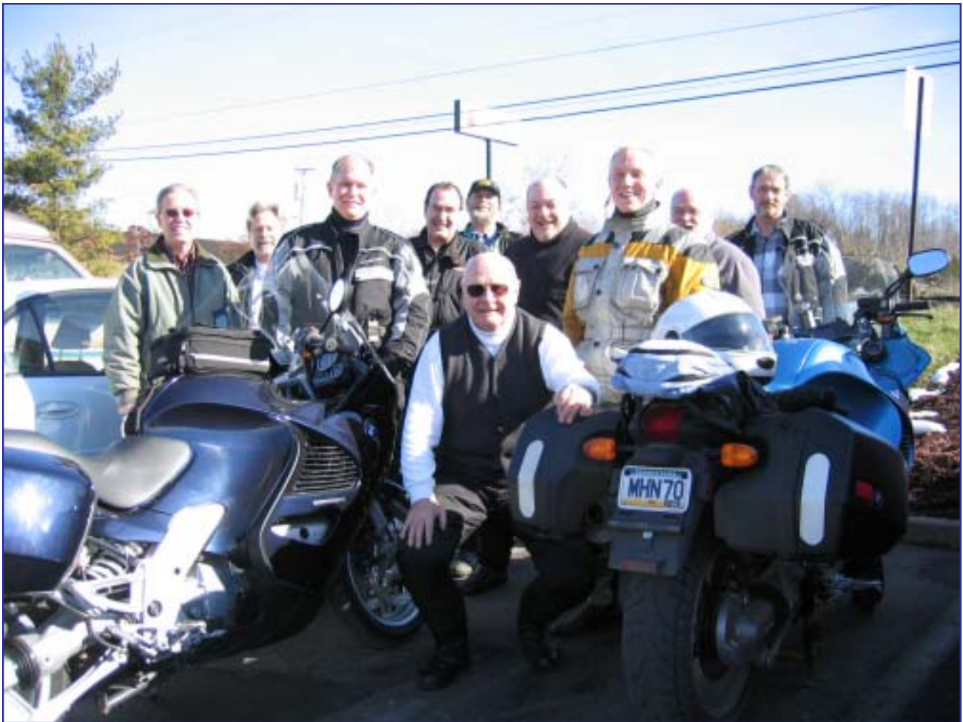
North Breakfast Riders - 2/6/2005