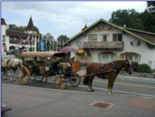
Horse and Buggy rides