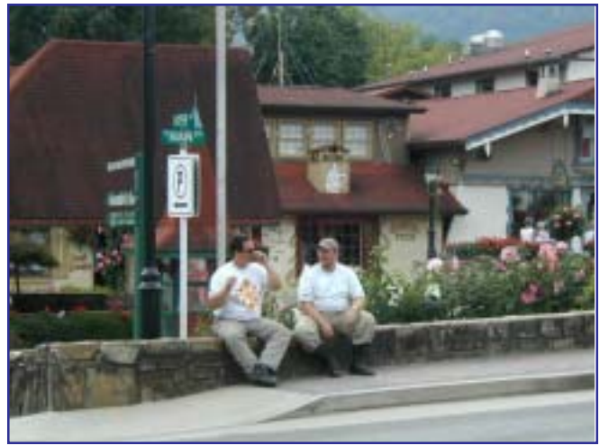
Two town vagrants!

I awoke with the left side of my head throbbing in pain. My ear felt like it was ten times its normal size. The medication I had started the day before probably didn't work its way into my system fully. Tylenol was in order but I had doubts about being able to ride, let alone being able to put my helmet on. A look outside showed bright sunshine and clear blue skies. So much for that hurricane expected in a day of so. Everyone else was up and dressed with ride plans for the day already in the works. Shirl could tell I was in no mood to be