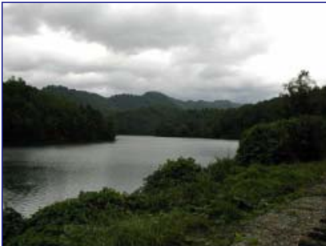
The Lake: The night before Ivan

"BIKE OVER!" Who the hell is that I ask myself? From the lower bedroom floor Jim yelled again. "WE HAVE BIKES OVER!!" Mass confusion, questions, chairs sliding backwards, people running to windows, someone saying "Whose Bike?" Imagine 12 people running for a gold brick. We ran outside with flashlights and umbrellas. Nicky's black "R" was over on its side. It had lost the ground under the center stand as a river of water flowed underneath. It has fallen onto Jim's "ST" which was now over on Tim's "LT". What a tangled mess!