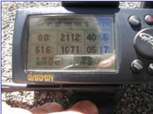
Last Shot, 2112 Miles, 40 plus hours of riding!

With downed branches and more debris we headed up behind the Western Pa School for the Deaf to our home. It felt great turning into that driveway just past 11:30 pm on the clock. Travel time for the day had to be over 13 hours. We had no signs of damage, but later we would find water on a windowsill upstairs. It was time for hot showers and off to bed. We both slept in very late the next day and when I awoke Shirl was talking with our neighbors, who were giving her an update on the weather and the devastation around SW Pa. The sun was out and it was a beautiful day and very hard to believe what others were facing at that time. I snapped the last photo of the trip recording the GPS log.