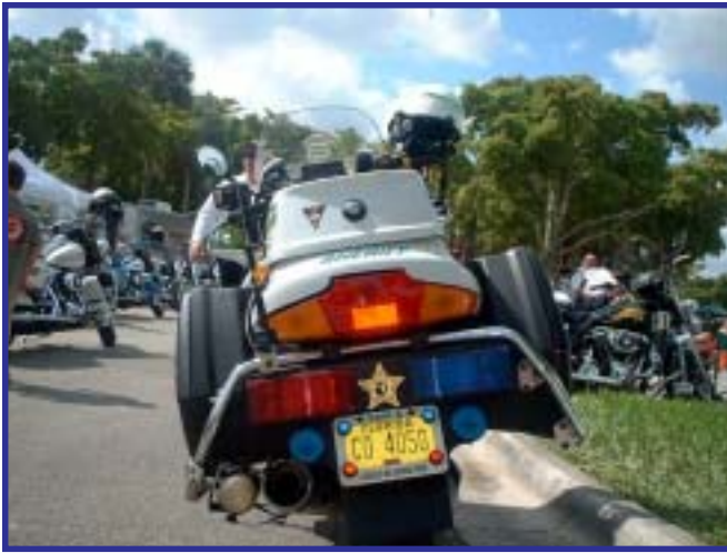
Whazzis???... An RT invasion of a Hardly Davidson convention or a Sheriff with a sense of humor... or both?