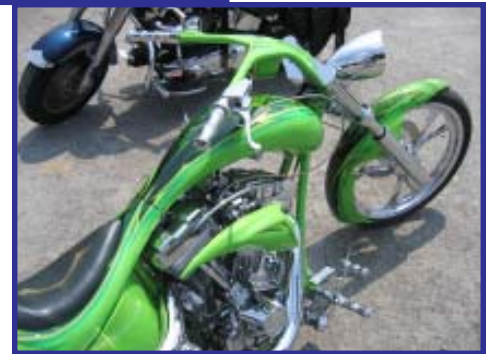
But... Horrible Riding Position! Eye Candy only!