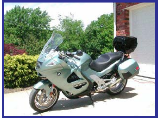
Conrad's K1200GT for sale.