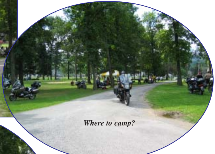
Where to camp?