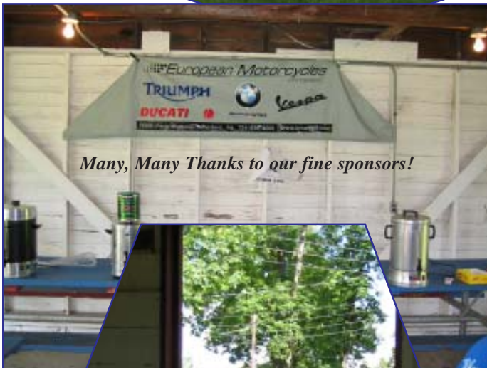
Many, Many Thanks to our fine sponsors!