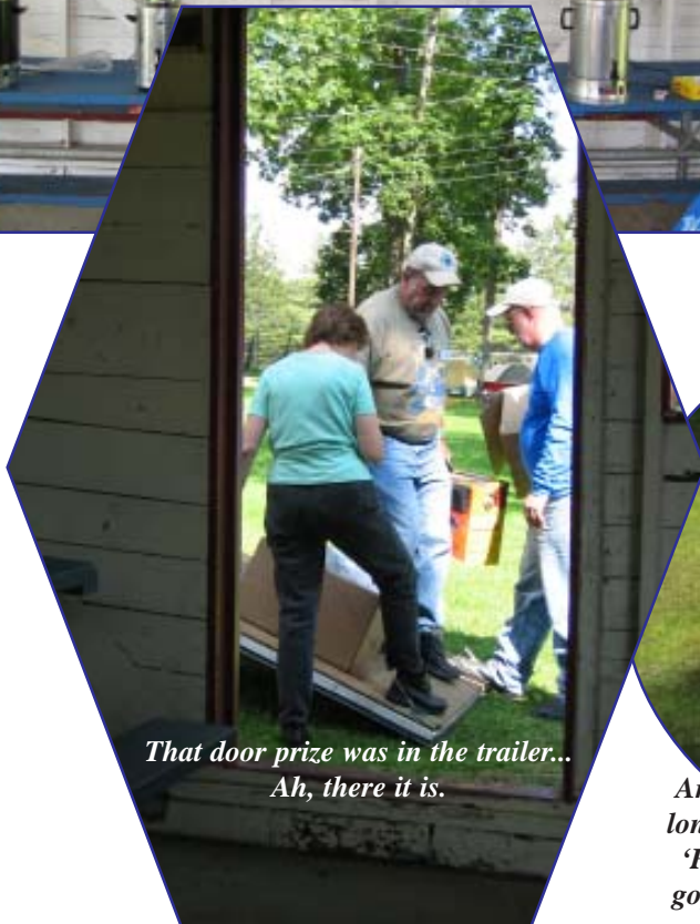
That door prize was in the trailer... Ah, there it is.