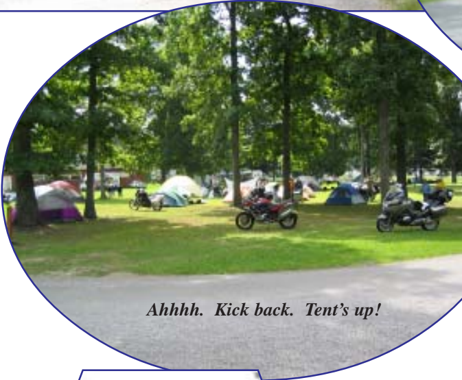
Ahhhh. Kick back. Tent's up!