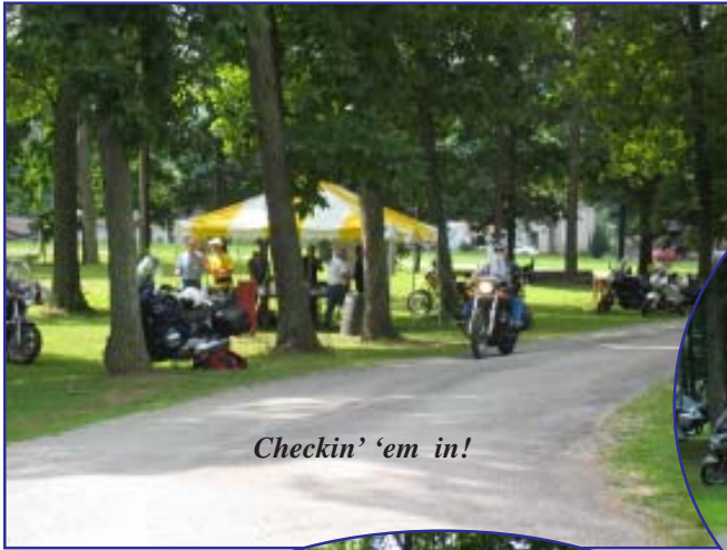
Checkin' 'em in!